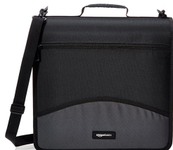
With shoulder strap!